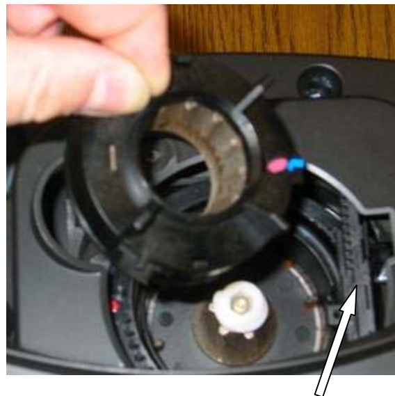
Doser Adjustment Lever.

Step 3: Lift out the upper burr by holding onto one of the fins on top. You will have to move the doser adjustment lever to the side slightly to get the upper burr past it.